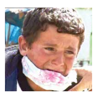
"THIS PHOTO PUT ME IN PRISON FOR 2 YEARS" 20

Let's not let YouTube and Wikipedia be shut down. These are the last channels where journalists can share information. If the Russian authorities close down social media, they'll get the propaganda they want. 8