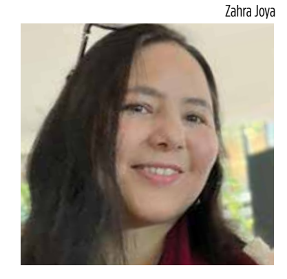
WE ARE NOT SAFE ANYWHERE IN THE WORLD 48